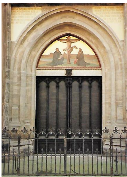
The 'Ninety Five Theses' Door Wittenberg 1996

In addition to the doctrine of justification by faith he asserted much of which is accepted as the norm in the Church of England today - the priesthood of all believers, the concept of national Churches, vernacular Scripture and liturgy, the use of hymns in worship and the freedom for clergy to marry.