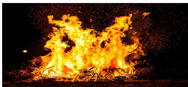
TUNLEY ANNUAL BONFIRE THURSDAY NOVEMBER 3 rd

AT THE RECREATION FIELD FIRE TO BE LIT 7PM HOT & COLD DRINKS – HOT DOGS, SNACKS, will be available. NO FIREWORKS PLEASE