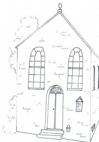
Withyditch Chapel Centre

Need a venue for a function? Why not try the Withyditch Centre?